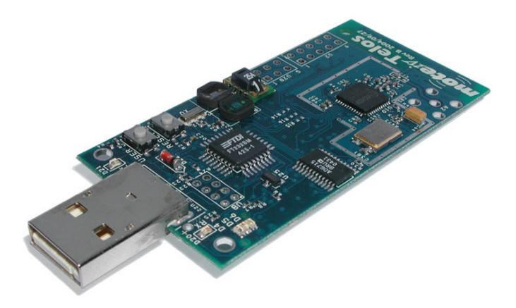
Fig. 1. Telos ultra-low power wireless module ("mote") with IEEE 802.15.4 wireless transceiver.

Mica [5], released in 2001, was carefully designed to serve as a general purpose platform for WSN research. Compared with preceding designs, it offered more memory (4kB of RAM and 128kB of flash), extensive sensor interfaces (8 analog lines, several digital IO